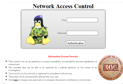
Users authentication page in 6 languages (en, fr, de, es, nl, pt)